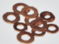
100 pcs HSK-811